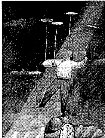
Illustration by Earl Keleny